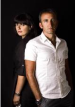
angeletti ruzza design _SENTO