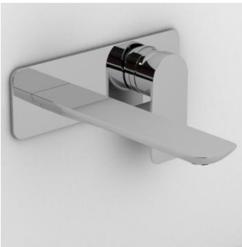
Wall-mounted basin mixer