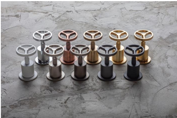
2.3 Collezione INDUSTRIAL JOB_design Andrea Zani : gamma colori

To contribute increasing the value of any mixer and giving it new and prestigious characteristics, Palazzani.eu made of functionality its pride, granting it through a series of new and exclusive systems as, for example, universal concealed body Unico ® , system Acquaclima ® to regulate temperature (to obtain a constant water flow at the desired temperature), Easy-clean ® system (to easily remove limestone), special device Drop-Stop ® (to prevent water going through the passing hole of the hose into the rim-mounted bath mixers or for hairdressing salons), kit Acquagreen ® (to reduce water consumptions of the mixer) and No-hot ® system (to keep the mixer at a mild temperature, even during prolonged use of hot water).